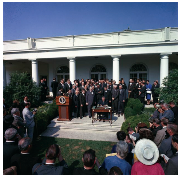
President Johnson signing the EOA, August 1964

In 1964, The Great Society, as envisioned by President Lyndon Johnson, was a sweeping plan to improve the lives of all Americans, regardless of their circumstances. Inspired by President Kennedy and his New Frontier, Johnson pledged to fulfill his promise of equal opportunity for all by enacting several comprehensive changes within the federal government. In August of that same year, the Economic Opportunity Act was signed into law by President Johnson creating the nationwide Community Action Network. There are now over 1000 Community Action Agencies throughout the United States and Puerto Rico in this coordinated effort to address the root effects of poverty and to, ultimately, move families and individuals to self-sufficiency.